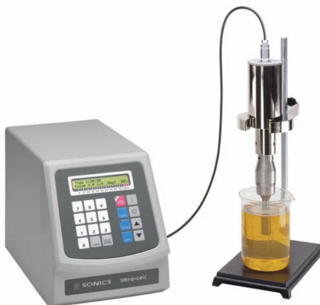
VC 505 – VC 750